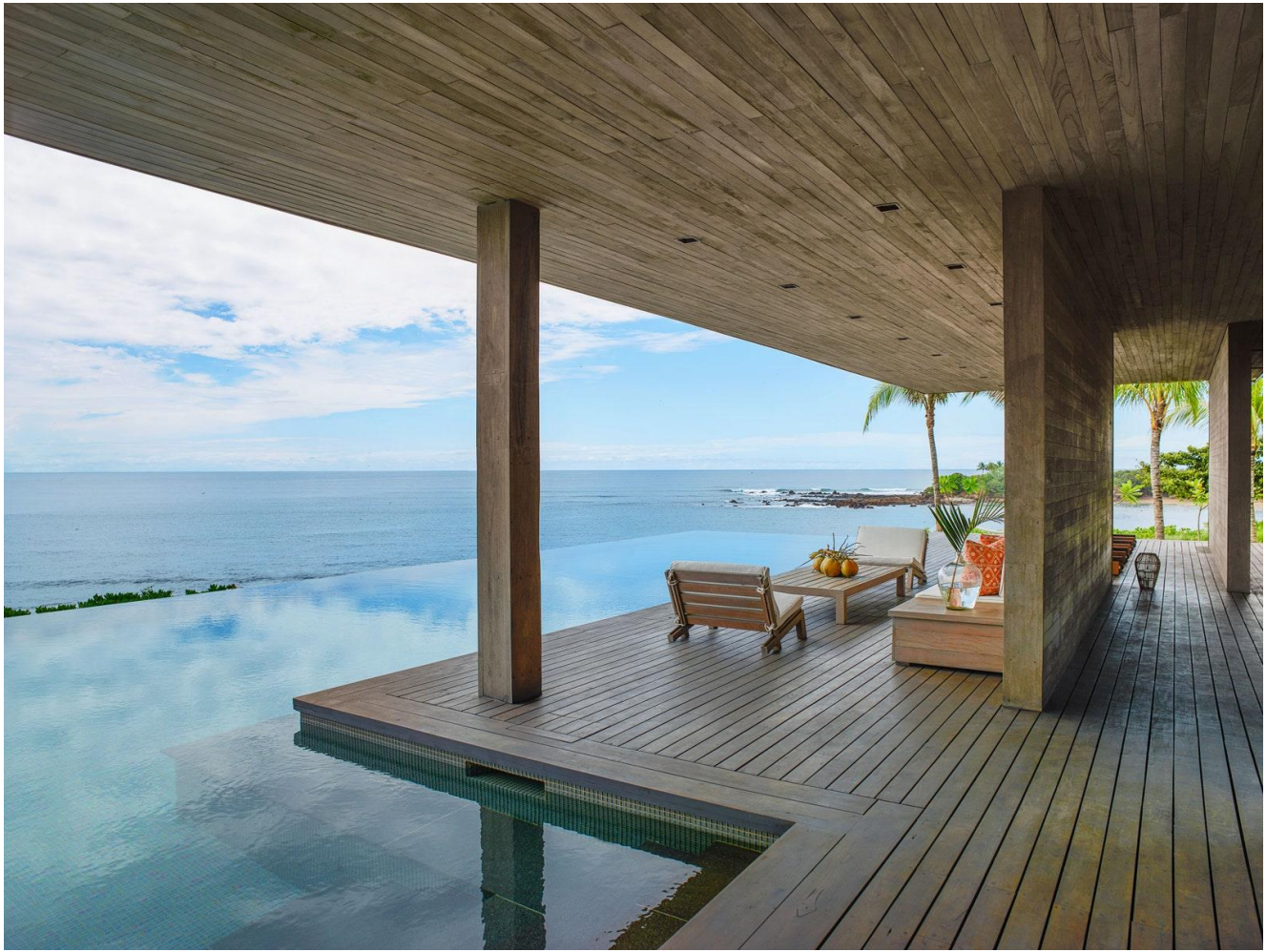
Teak furniture by Studio Tlalli creates a sitting area on the poolside deck. The decorative pillows are made with a Carolina Irving Textiles linen.

It's all in the details. Even the deceptively simple-looking, gently sloping thatched roofs that roll outward to create shade are a modern feat of engineering. "There are no nails," Lauder says with awe. For the roofs, IM/KM collaborated with VTN Architects, a Vietnam-based firm globally recognized for its bamboo pavilions. "The challenge was, how can we create something primitive in construction but make it air-conditioned?" says Ivan, adding that six engineers from New York and a translator completed the effort. The end result, Lauder points out, "really creates that indoor-outdoor, tropical feeling."