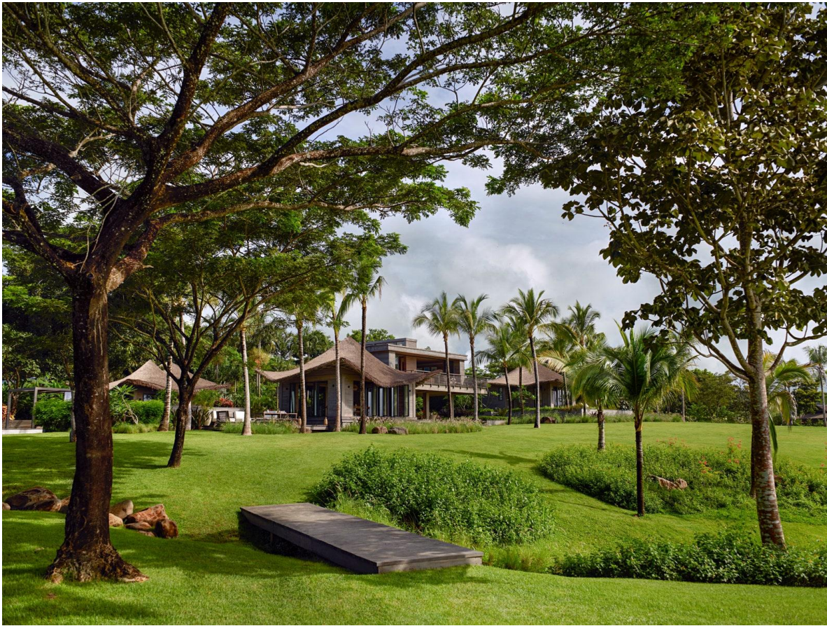
Distinctively designed overhanging thatched roofs help provide shade for the compound's buildings.

“It’s a completely different way of living,” Lauder continues, pointing out that there’s not even a front door at Casa Loro. While her husband and sons spend their days adventuring, Lauder goes for leisurely walks along the beach or lounges by the pool with a book. The catch of the day gets sliced into ceviche; fruit is plucked straight from the surrounding trees. There’s no florist to call on. Instead, Lauder styles the rooms with fresh cuttings from around the property. “The vegetation is very inspiring,” she says, noting that landscape designer Titi Hernández helped to curate the selection. Of the perfectly laid-back nature of it all, she adds: “There’s something very peaceful about just having a quiet day. The interesting thing about it is, there’s nowhere to go. There is no town with shops to run into. There’s no one to meet for lunch. It’s all about family time. That’s really what makes it so special.”