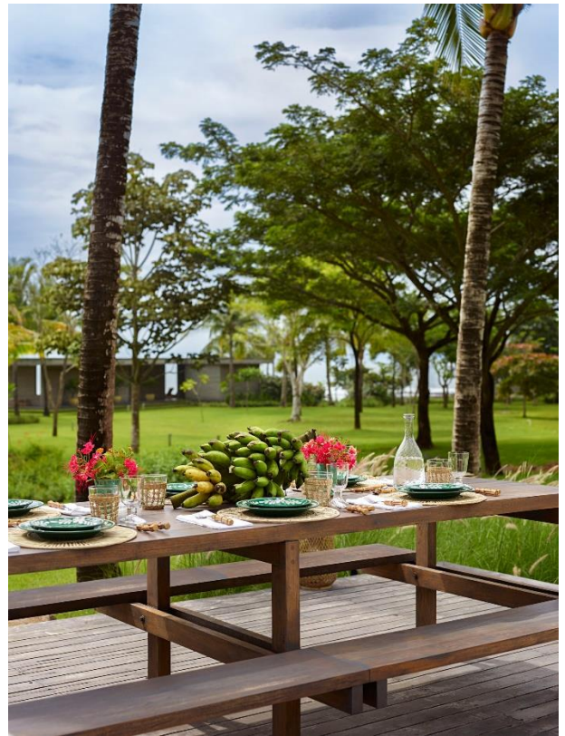
The outdoor dining table is set with plates from the Carolina Irving & Daughters for AERIN Collection and placemats, napkins, and flatware by AERIN.