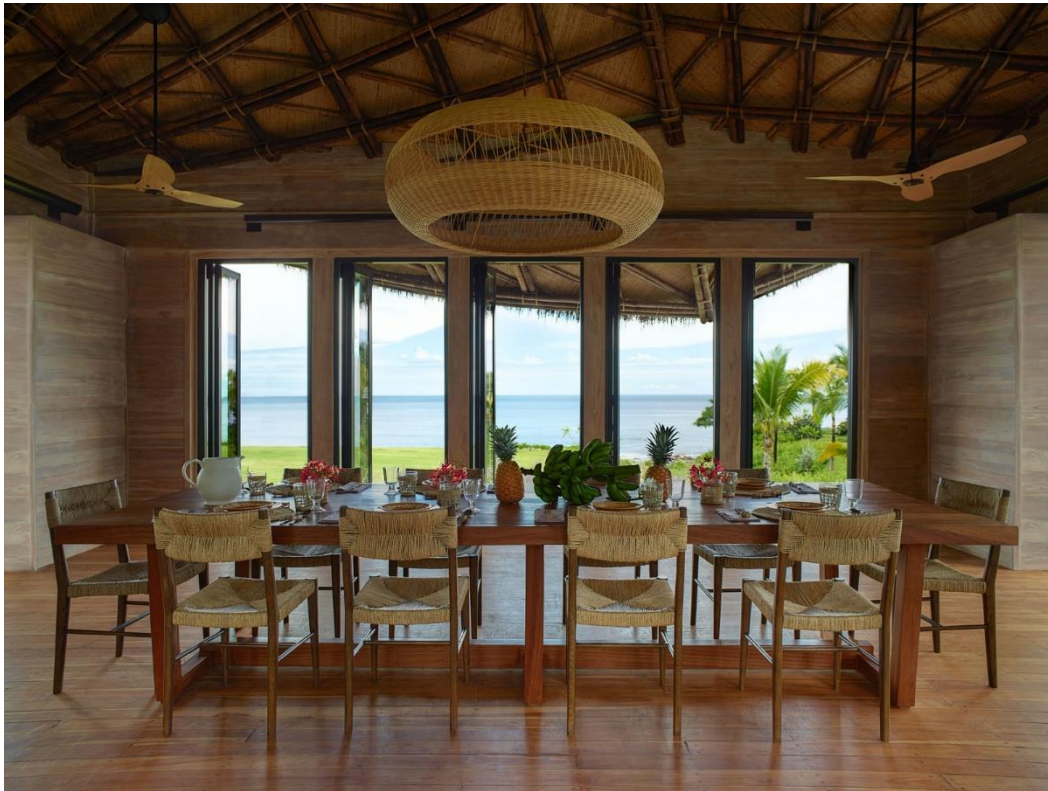
An Atelier Vime pendant hangs above the Studio Tlalli dining table surrounded with Serena & Lily chairs. Ceiling fans by Big Ass Fans.