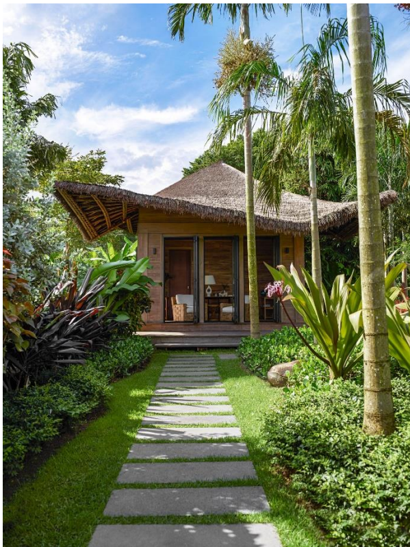
A thatched-roof pavilion at Aerin Lauder's Panama retreat.