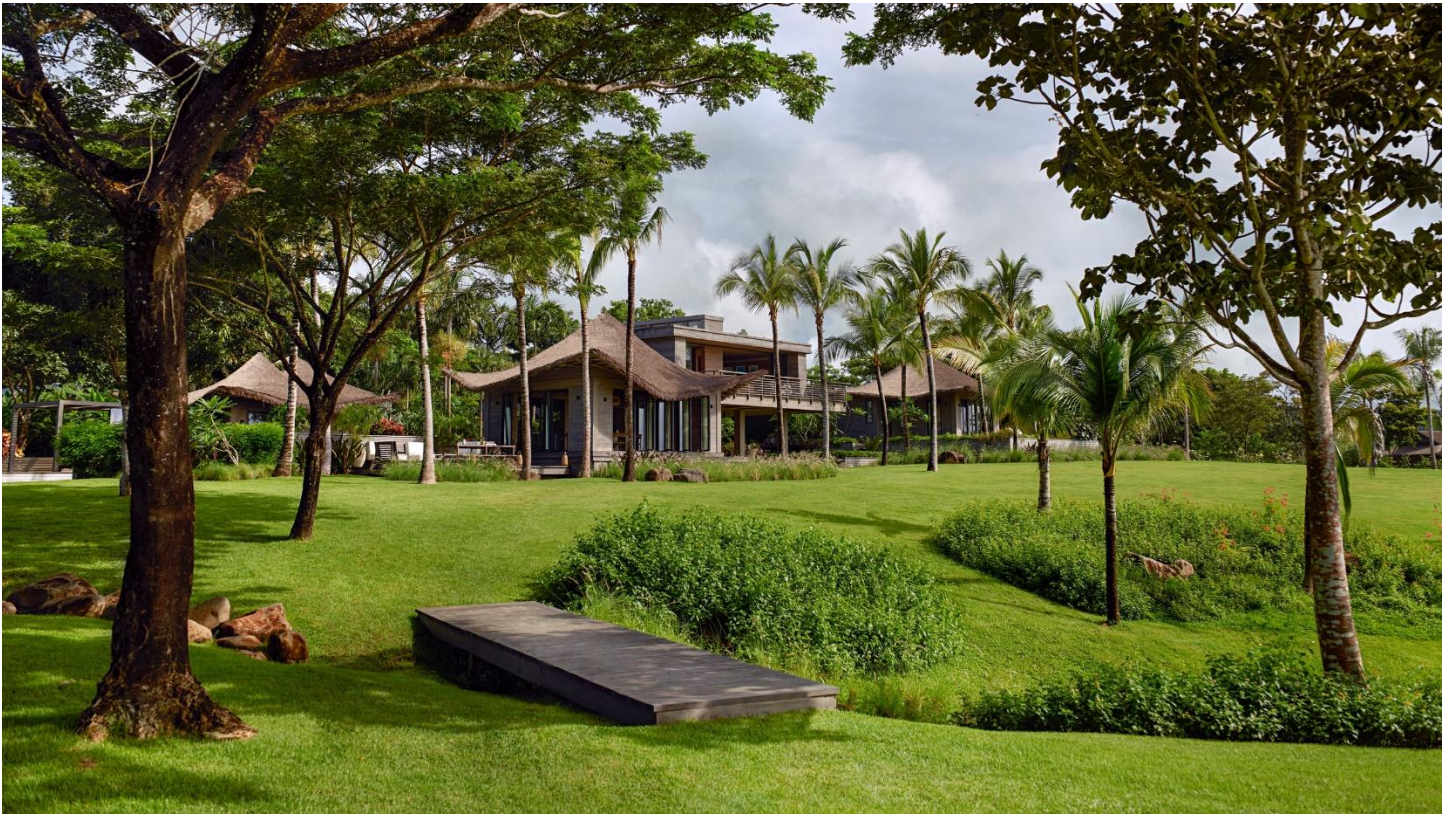
Distinctively designed overhanging thatched roofs help provide shade for the compound's buildings.

All products featured on Architectural Digest are independently selected by our editors. However, when you buy something through our retail links, we may earn an affiliate commission.