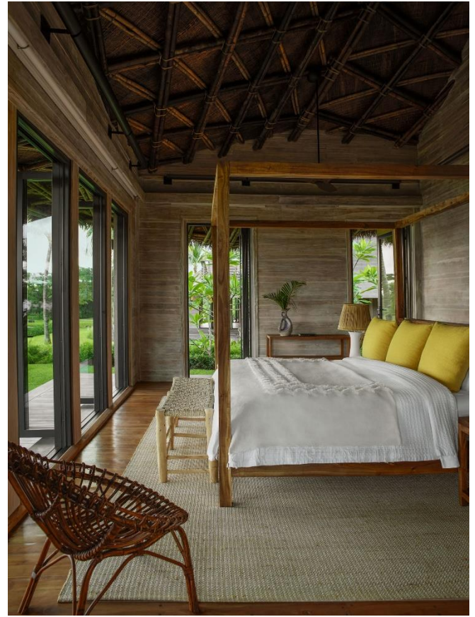
In the primary bedroom, a vintage bench stands at the end of a Studio Tlalli four-poster. Patterson Flynn rug.