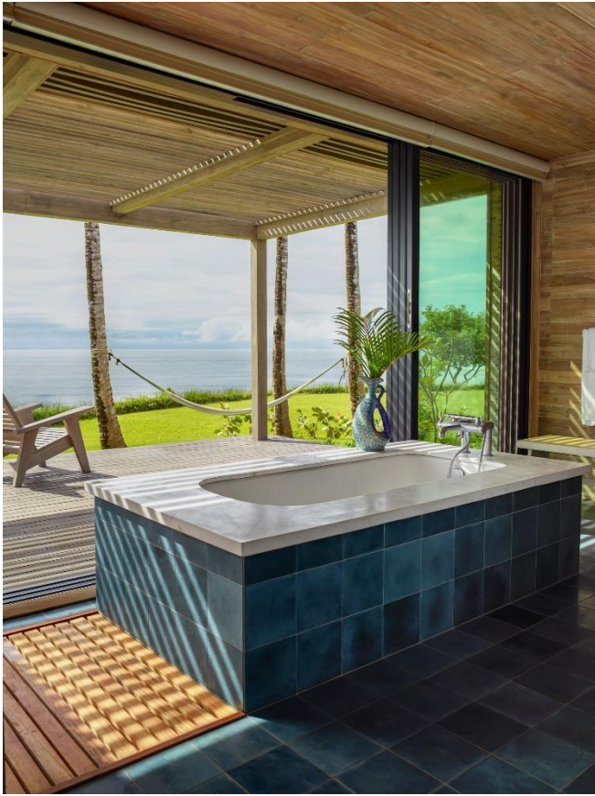
The tub is clad in encaustic cement tile by Clé.