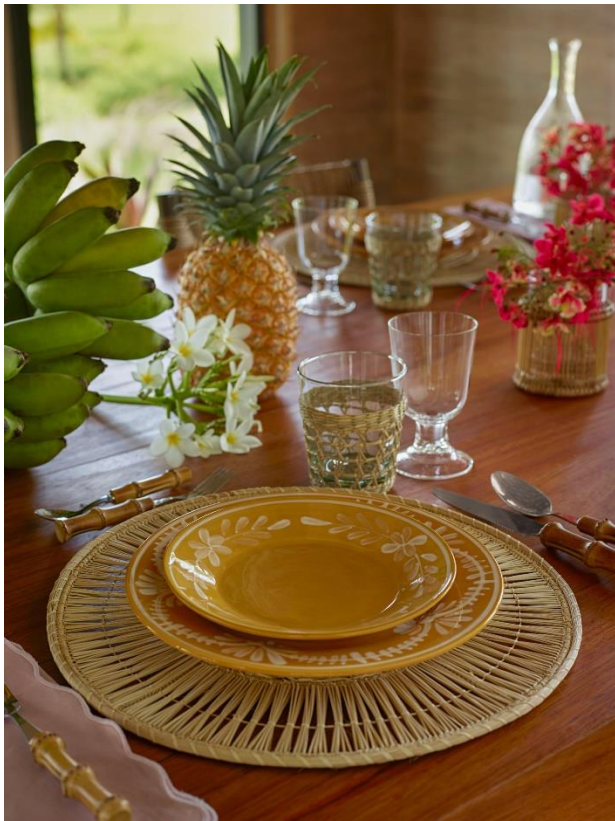
The table is set with plates from the Carolina Irving & Daughters for AERIN Collection. Placemats, napkins, and flatware all by AERIN.