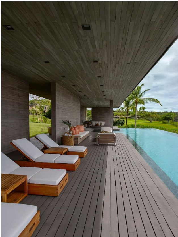
A row of Sutherland Furniture armless chaise longues stands alongside the pool.