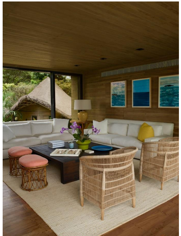
A view of the indoor living room.