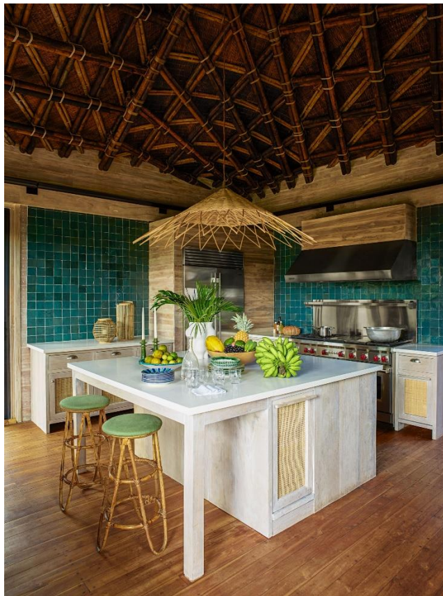
Vintage stools with cushions of a Pierre Frey fabric pull up to the kitchen's Caesarstone-topped island. Atelier Vime pendant light; Zellige tiles by Clé; Sub-Zero Refrigerator; Wolf Range.