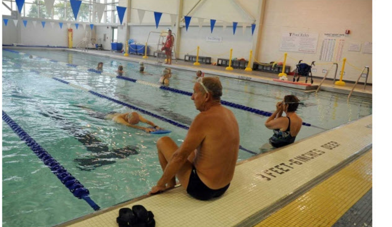
Swimmers take advantage of the indoor pool, where the water's 85 degree in a glass-enclosed space, at the new YMCA in Patchogue. (Oct. 12, 2010)

QUICK SUMMARY The pool's cool, but there are lots of other activities for families at the new YMCA