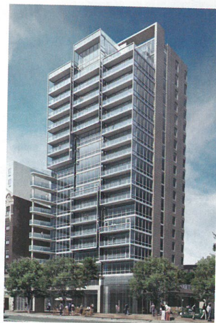
A new 47-unit, 19-story condominium building is rising on Central Park North in Manhattan.

Bovis Lend Lease is construction manager on the project, which is scheduled for completion next summer. <<