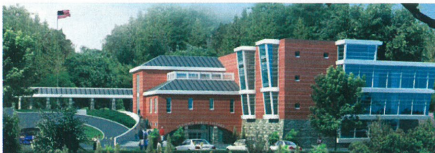
A new 45,000-sq.-ft. library facility in Ossining, N.Y., will have several green construction features, including a geothermal cooling and heating system, drought-resistant landscaping, and debris recycling.

The project incorporates several green elements, including the recycling of 92 percent of demolition debris, a curtain wall system that allows the building to rely on natural light for 70 percent of its illumination needs, drought->>