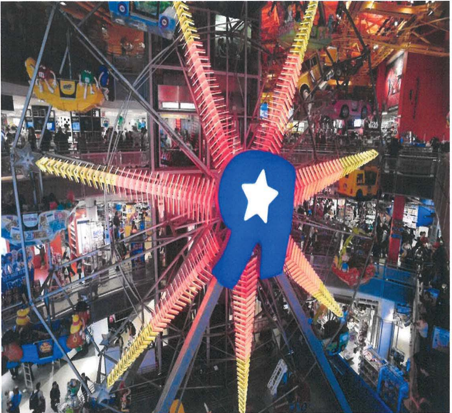
The Toys 'R' Us store centerpiece was a 65-foot-tall Ferris wheel.

A Toys "R" Us spokeswoman declined Tuesday to comment about the closure, but said the search for a new location is ongoing.