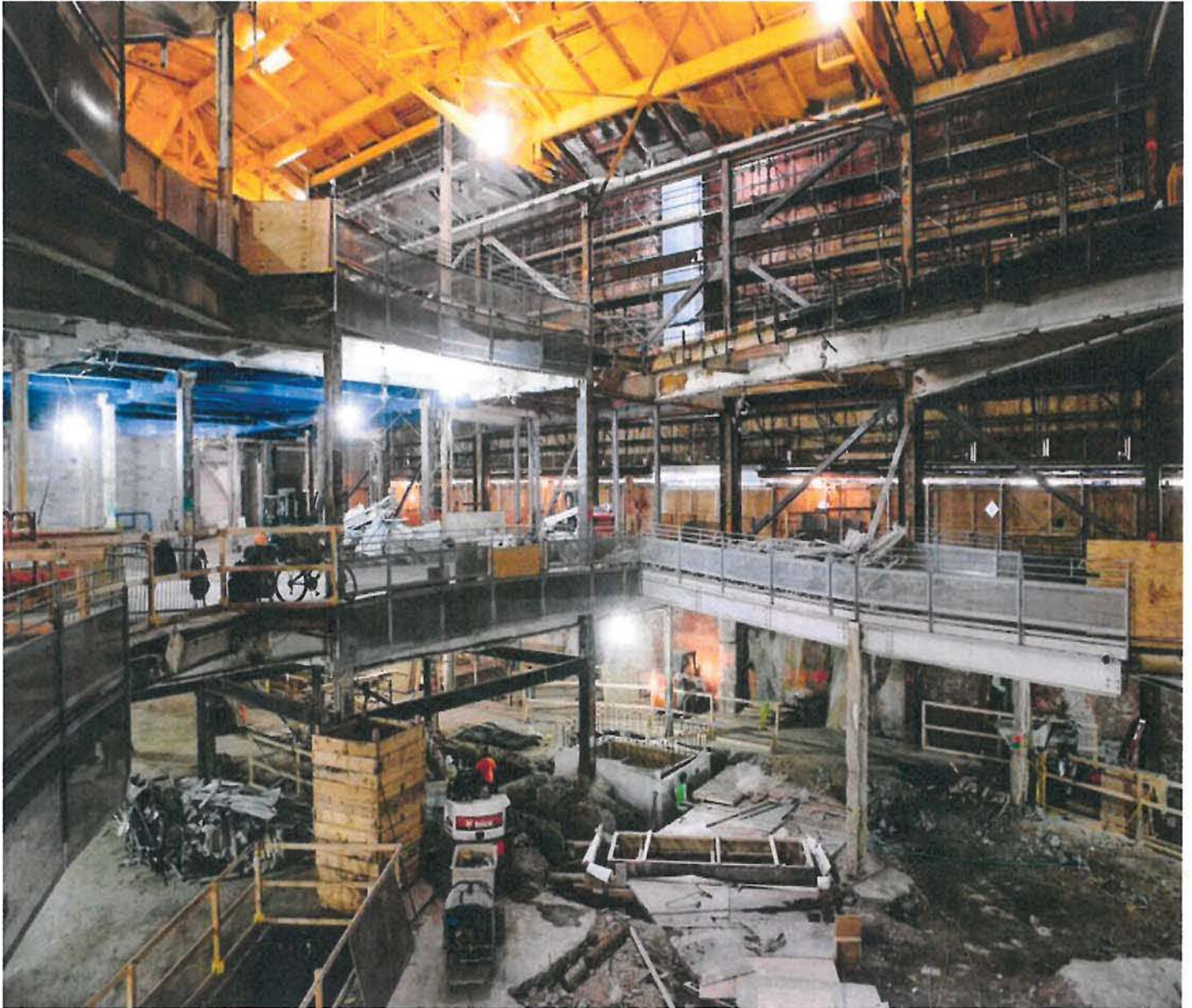
Inside the Bow Tie Building in Times Square. The 160,000-square-foot space was once home to the Toys 'R' Us flagship store.

The 160,000-square-foot space will house Gap and Old Navy flagship stores